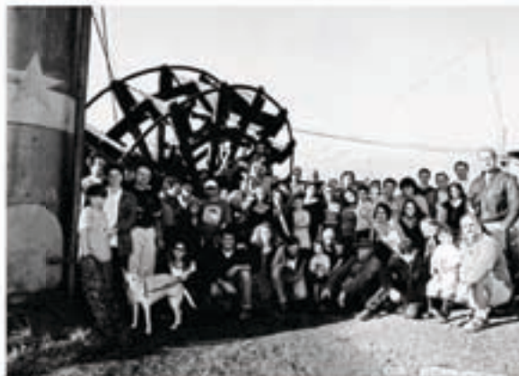
2005, before reconfiguration of the docks begin