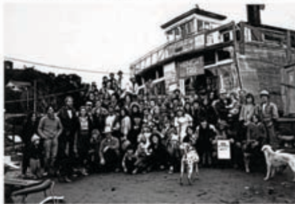
1929 before the Charles Van Damme was demolished.