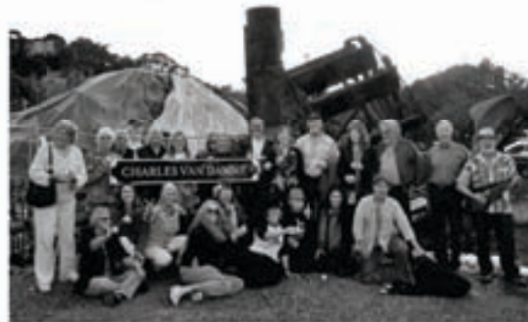
2013, 30yrs after the boat was demolished - Courtesy of Hans at the Mantiscope.

PEOPLE HAVE LOVED THE CHARLES VAN DAMME FERRY FOR ALMOST 100YRS.