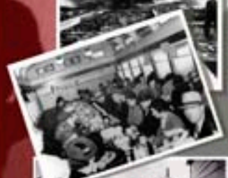
The success of the Richmond Ferry Boat Line & Transportation Company made it possible for the company to build a ferry boat named after the U.S. Navy, the USS Richmond (LST-1131), which was launched in 1945.