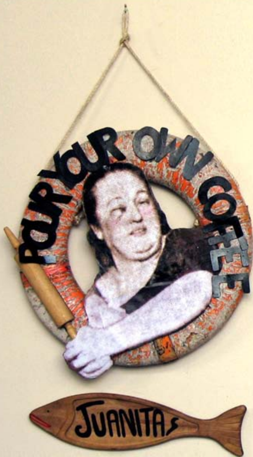
Artwork by Dona Schweiger