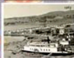
The Charles Van Damme before and after Juanita filled in the Bay