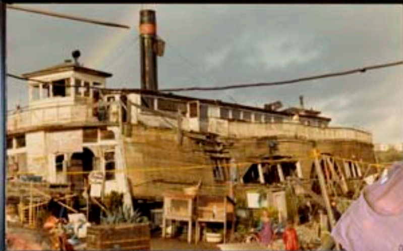
There was a picture over the van damme the morning before she went down.